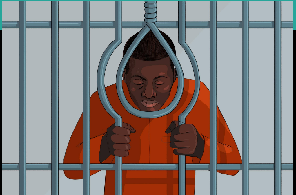
Illustration by Lily Padula